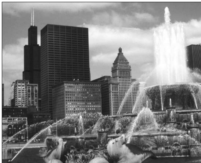
Buckingham Fountain, Chicago, Ill.